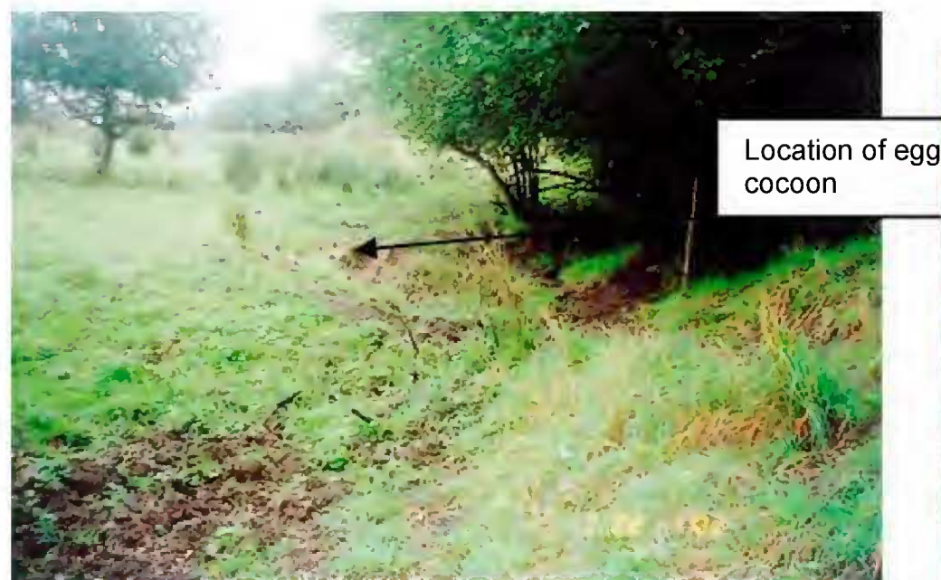
Plate 1a. Location of a Giant Gippsland Earthworm egg cocoon – site 1b